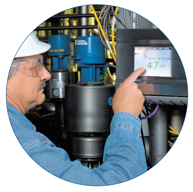
Controlling oxygen levels with the ORBISPHERE K1200 and 510 controller

All diagnostic information as well as user programmable measurement alarms can be assigned to 1 of the 3 available relays or to 1 of the 3 smart analogue outputs.